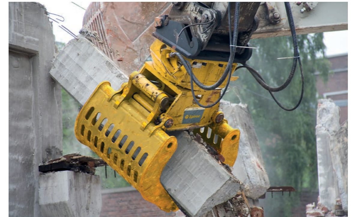
Our Multi Grapples handle any material with utmost precision. They deliver a steady grip and virtually constant closing force.

Our Multi Grapples are ideal for loading and sorting various materials as well as demolishing wooden and masonry structures.